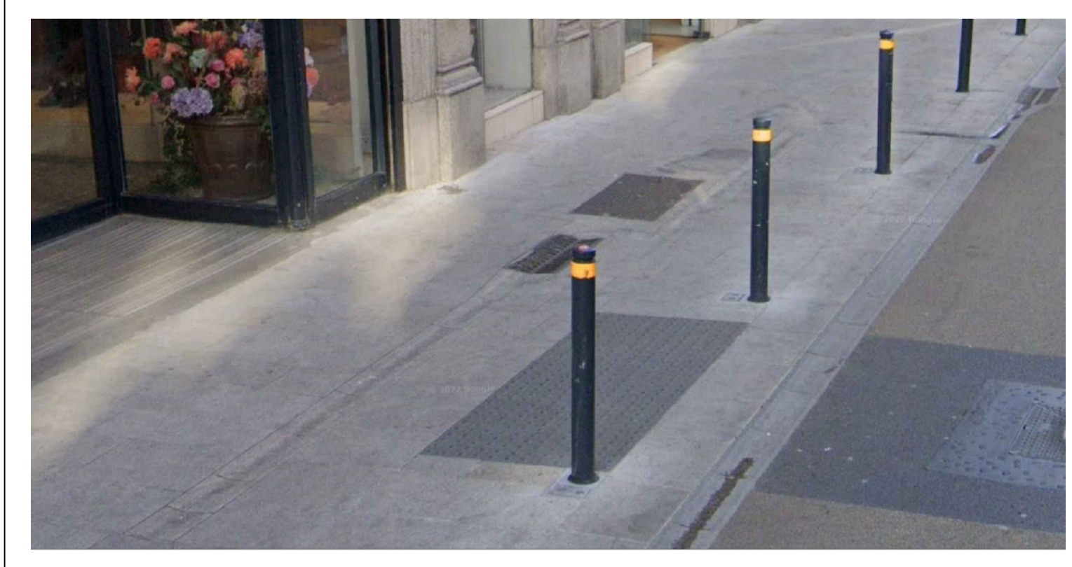
TYPICAL DISHED CHANNEL AND CHANNEL GULLY LAYOUT